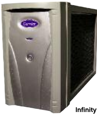
Infinity Air Purifier Model GAPA

The Infinity air purifier combines superior filtration efficiency with pathogen-killing technology to deliver maximum air purification.