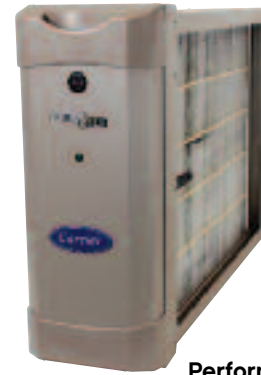
Performance Air Purifier Model PGAPA